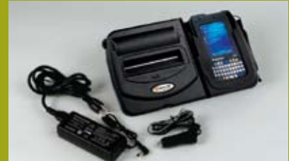
Accessories used to charge both the PrintPAD and mobile computer

No hidden cost - Another way to keep cost down is to look for hidden cost. Unlike some other products on the market, the PrintPAD batteries are included in the purchase price. And when its time to replace them, the PrintPAD uses economical replacement batteries. This can add up to big savings for your company.