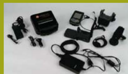
Accessories used in a typical application involving a separate printer and mobile computer.